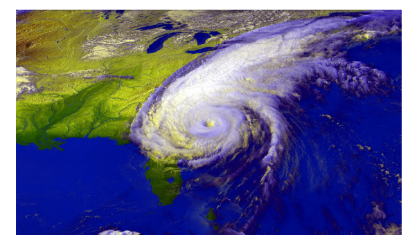
Hurricane Floyd takes aim at the North Carolina coast in 1999.

sity of Oklahoma, Renaissance Computing Institute (RENCI), University of North Carolina at Chapel Hill, Seahorse Coastal Consulting, NWS Forecast Offices in Raleigh, and Newport/Morehead City, NWS Southeast River Forecast Center, NOAA Office for Coastal Management, NOAA in the Carolinas, NOAA Southeast and Caribbean Regional Team (SECART), NOAA-Integrated Ocean Observing System, Department of Homeland Security Coastal Hazards Center of Excellence, Centers for Ocean Sciences Education Excellence SouthEast, Coast Survey Development Laboratory and NWS Office of Hydrologic Development.