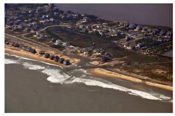
Flooding from Hurricane Irene in August, 2011 sliced through Highway 12 on the Outer Banks of North Carolina.